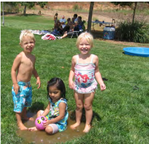
Does someone look a little bit more happy in these pictures compared to those on page 3? :)