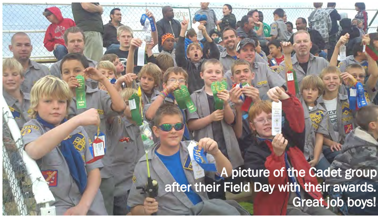
A picture of the Cadet group after their Field Day with their awards. Great job boys!

Car Hop Fundraiser at church. All youth and at least one parent should plan to help with this event; talk to Danae ASAP with any conflicts.